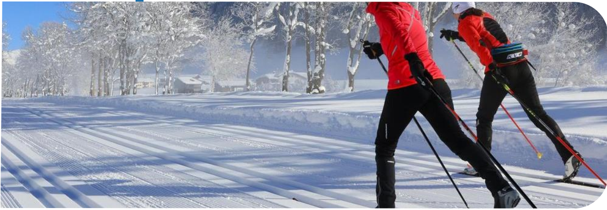
cross country ski trails