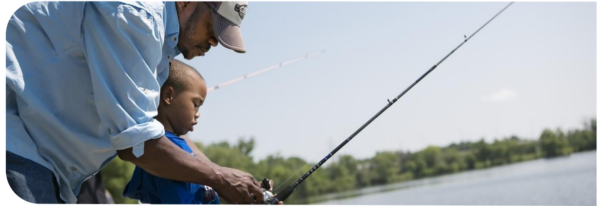
river access from shore