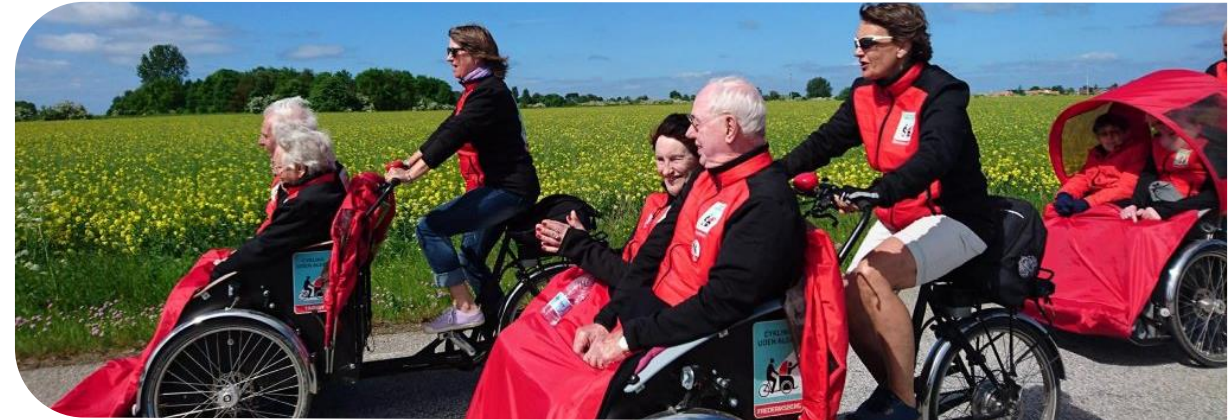
ensure accessibility for cycling without age