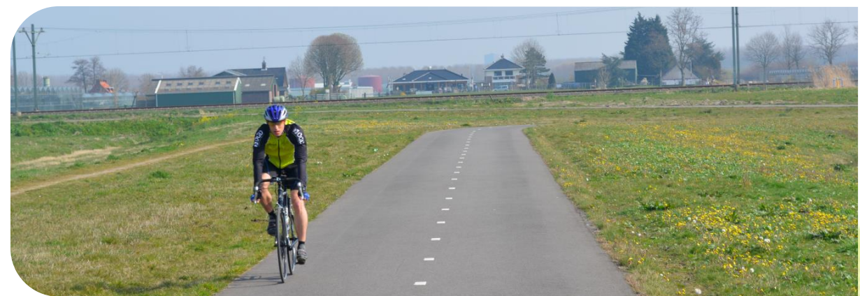
dedicated bike lanes