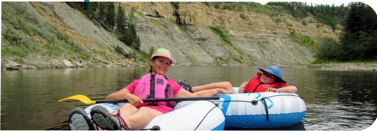
direct river access